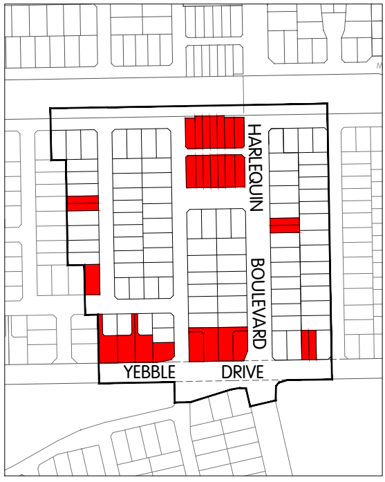
LOCATION PLAN ■ SUBJECT LOTS