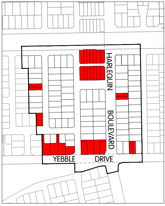
LOCATION PLAN ■ SUBJECT LOTS

Adopted by the City of Busseton pursuant to Local Planning Scheme No. 21 in accordance with delegation S7-01F of Council on the ..... Day of ..... 20..... Director, Planning and Development Services